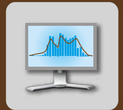
Traffic information in real time