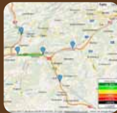
Travel time loss